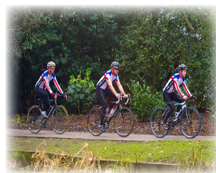
Parkfield, Potters Bar