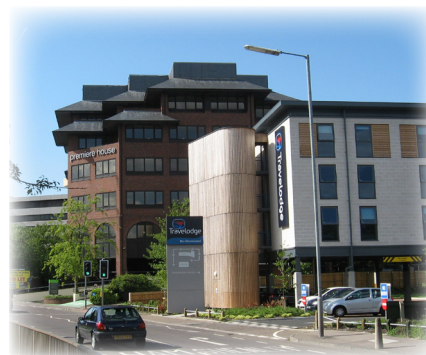
Elstree Way, Borehamwood