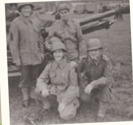
Filming of The Dirty Dozen 1966 at Elstree Studios.

A reminder of the former studios and its glamorous past are found in local road names remembering the stars – such as Balcon Way after film producer, Sir Michael Balcon; Grace Close after Oscar-winning film star Grace Kelly, and Lion Court named after the symbol of MGM studios. Standing sets for some well-known films were built here and include a castle for Ivanhoe , a French château in The Dirty Dozen and a Chinese village in The Inn of the Sixth Happiness . Many other feature films, as well as television productions including The Prisoner and UFO , were shot in and around this area. Some of the mature oak trees dotted around the site have made cameo appearances in the background of famous films.