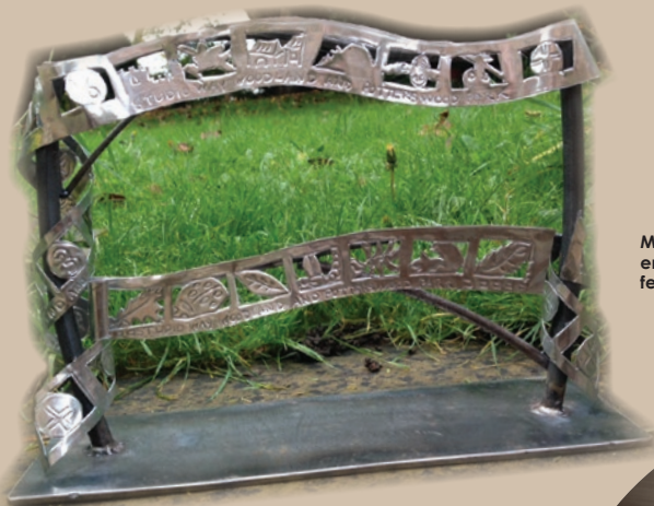
Model of entrance feature

Top L-R: The Prisoner , Ivanhoe , 633 Squadron , MGM Clock Tower , Inn of the Sixth Happiness , 2001 A Space Odyssey , Where Eagles Dare , The symbol from the end of a film reel .