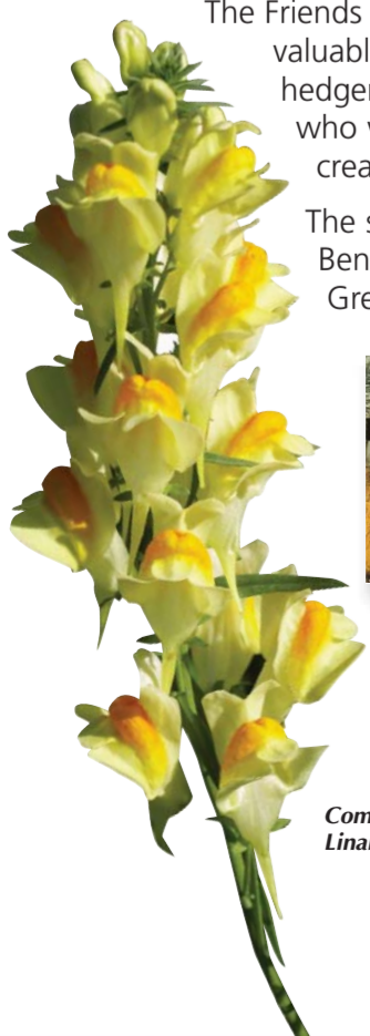
Common Toadflax - Linaria vulgaris