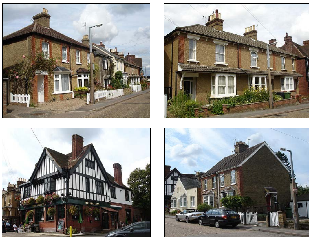
Figure 50. Properties proposed for inclusion in the conservation area on Bournehall Road: Nos. 1, 3, 5 & 7; Nos. 9, 11 & 13; The King Stag PH; Nos. 23, 25, 27 & 29

3.2 The buildings share some of the same characteristics that are already associated with those properties on Park Road and Glencoe Road that are already within the boundary. The King Stag Public House has a strong character within the street scene and appears on the Draft List of Locally Important Buildings in Hertsmere.