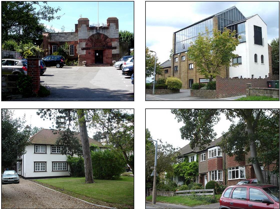
Figure 51. Properties on Melbourne Road to be included in the proposed new conservation area: Lululaund , the former Bushey Studios, nos. 20 & 22, and nos. 35 – 41