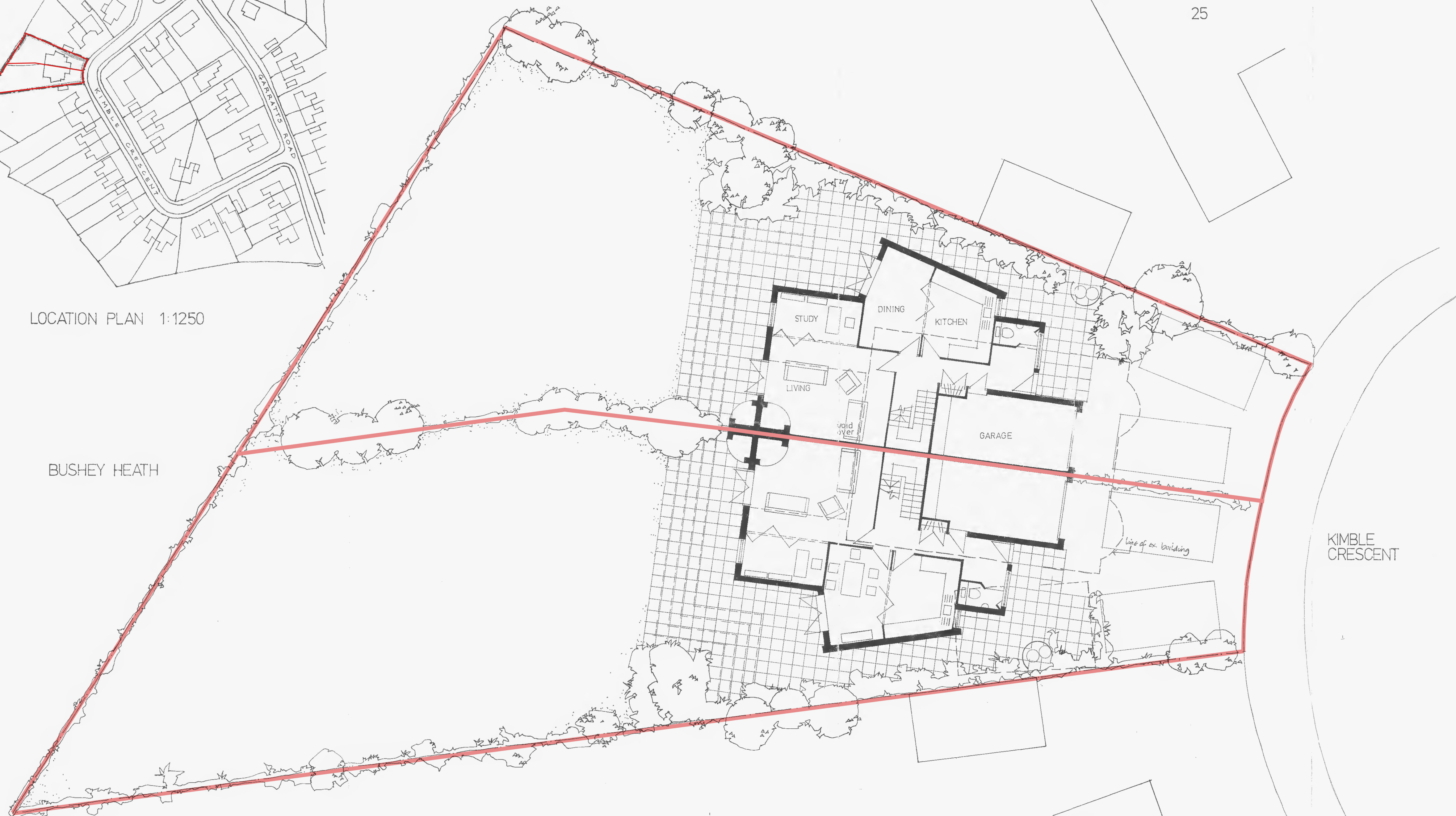
SITE / GROUND FLOOR PLAN 1:100