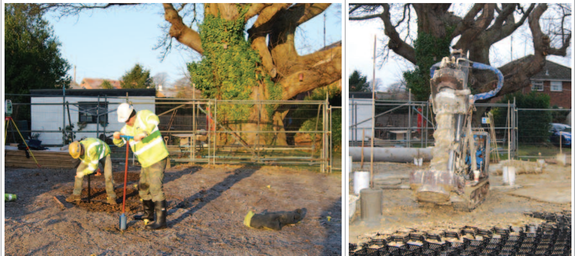
Using a hand auger to ensure proposed locations for piles do not conflict with tree roots within the root protection area of a veteran sweet chestnut tree. Note the BS 5837:2005 specification fencing in the background. The area was then covered with ground protection to allow a lightweight piling rig to work without damage to the underlying tree roots.