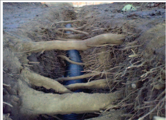
A section of drainage pipeline installed under tree roots following excavation using an air spade.