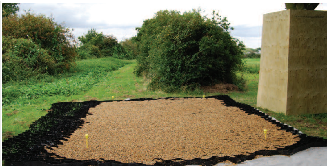
Ground protection used effectively to allow for construction within a tree root protection area, and the tree stem appropriately protected from any collision with construction vehicles.