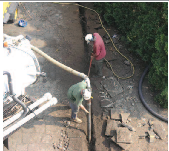
Excavating around tree roots using an air spade to avoid damage.

The photograph to the right shows a trench being excavated along the footprint of a proposed extension. All roots within the trench were plotted, allowing the foundation of pile and above ground beam foundation to be.