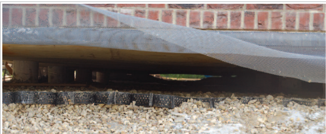
Use of house deck ® foundation system with anti heave void, to allow for foundations to be constructed within the tree root protection areas, and above ground level. This construction method prevents any future structural damage caused by ground heave due to the removal of trees on clay soil before or after construction. Although voids can become homes to vermin, a metal mesh net will prevent this.