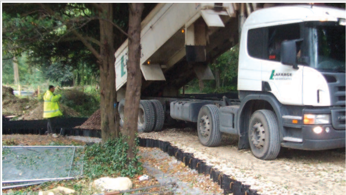
Installing a special surface to allow for heavy plant access through sensitive woodland during construction.