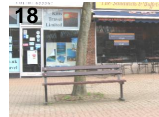
18. Could a bench be placed either side of the tree? (Darkes Lane, Potters Bar)