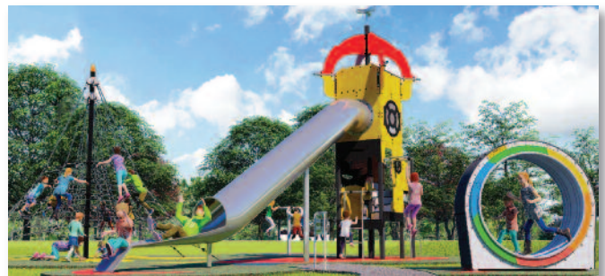
Oakmere Park improvements, Potters Bar

Discounts or exemptions are available to people who live on their own, to students and to people with certain disabilities. Contact the helpline number above or email revenues@hertsmere.gov.uk for further details.