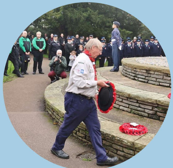
Royal British Legion Remembrance Sunday Parade