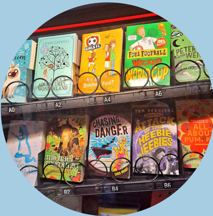
Book vending machine at Bushey Heath Primary School

In 2022-23, 43 organisations were supported, totalling £23,755. Grants awarded included support for Jubilee Celebrations, funding safety equipment to distribute throughout the community, as well as purchasing supplies for organisations such as Mencap, Kenilworth School and Bushey Museum running a variety of different projects throughout Hertsmere.