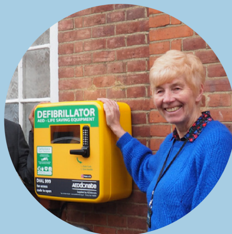
Relocation of the defibrillator outside Bushey Museum