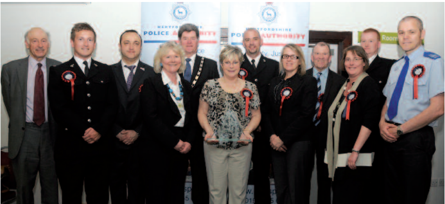
Police Authority Awards 2012

Business Watch in Centennial Park , Elstree was launched in March 2012. Forty-eight companies from Centennial Park signed up to the new scheme, which will provide companies with information about crime patterns around the park via the Online Watch System (OWL). The park has been targeted by criminals coming over the border from London to commit crime, such as theft from vehicles, theft of scrap metal and catalytic converters. This scheme enables businesses to be aware of what crimes are happening so they can make informed decisions about their security and look out for anyone acting suspiciously.