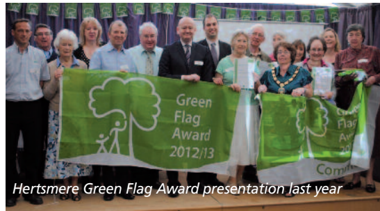
Hertsmere Green Flag Award presentation last year

For further details on Green Flag Awards across the country please visit www.greenflag.org.uk