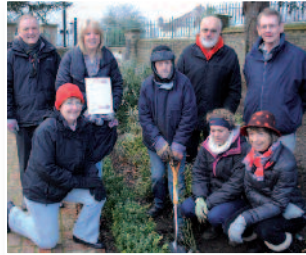
Friends, volunteers, councillors and officers with the Landscape Institute Award

planned to celebrate including the Centenary Garden Party on Sunday 30 June featuring Watford Brass Band, stalls, children's activities and refreshments. For further details on all the events across this summer please see page 12.