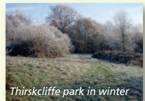
Thirskcliffe park in winter

In the future the meadows will be managed by taking a hay cut, enabling wildflowers to reappear. A wildflower meadow in summer is a wonderful thing: colourful, fragrant and alive with butterflies. Make sure you take the time to visit the park in July and appreciate its natural beauty.