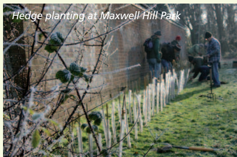
Hedge planting at Maxwell Hill Park

If you are interested in joining the Wednesday Volunteer team and contributing to the diverse range of environmental project work, please contact CMS at: northeast.cms@hertscc.gov.uk