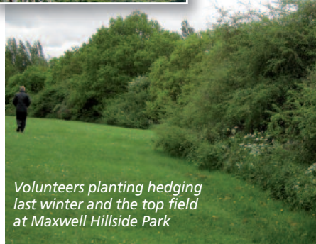
Volunteers planting hedging last winter and the top field at Maxwell Hillside Park

Future work includes a new footpath connecting visitors from Hillside Avenue to the existing footpath from Maxwell Road, new benches, signage, tree planting and increasing areas of meadow grass. The improvements are being funded by a local development.