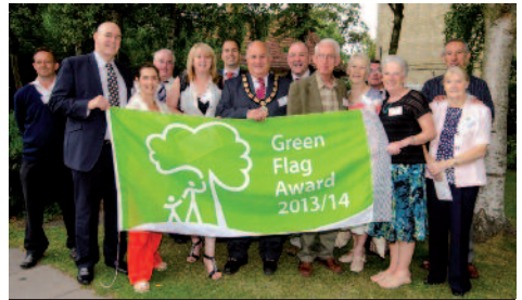
Pictured are officers and Friends group members at the ceremony in Royston

For more information visit www.greenflag.org.uk