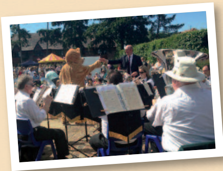
Pictured are Watford Brass Band performing at the Garden Party and gardeners from the Peace Palace with officers and garden historians