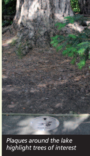
Plaques around the lake highlight trees of interest