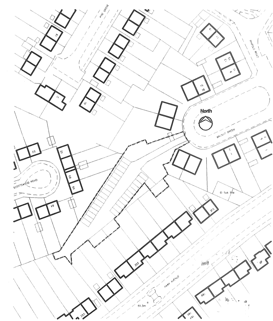
Location Plan as Existing 1:1250@A1