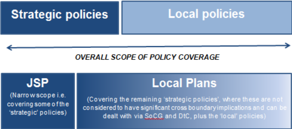
Figure 3: Relationship between the South West Herts JSP and Local Plans

4.37 Each council will continue to be responsible for preparing its own Local Plan, but the JSP will also provide the platform to consider how the challenges of growth in the wider South-West Hertfordshire area can be addressed longer term (i.e. to 2050). Figure 4 below illustrates how these two key planning documents will fit together.