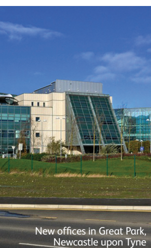
New offices in Great Park, Newcastle upon Tyne