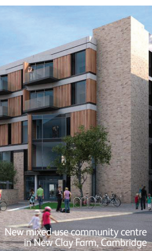
New mixed-use community centre in New Clay Farm, Cambridge