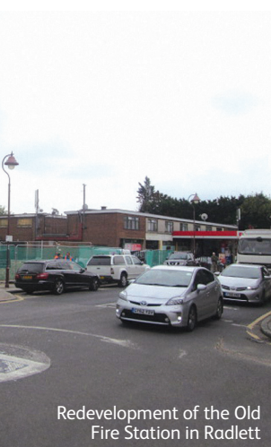
Redevelopment of the Old Fire Station in Radlett