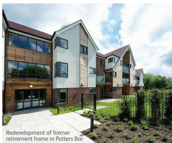
Redevelopment of former retirement home in Potters Bar