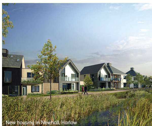
New housing in Newhall, Harlow