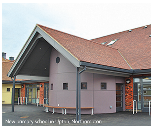
New primary school in Upton, Northampton