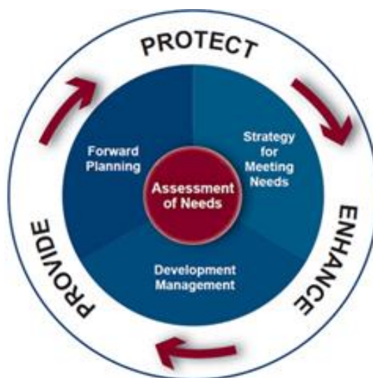
Figure 2.1: Sport England themes

To provide new outdoor sports facilities where feasible and there is current or future demand to do so.