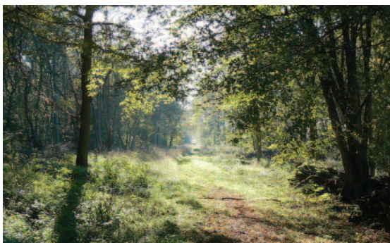
Balls Wood, Hertfordshire.

Source: Clare Gray, Herts and Middlesex Wildlife Trust. ( www.wildlifetrust.org.uk )