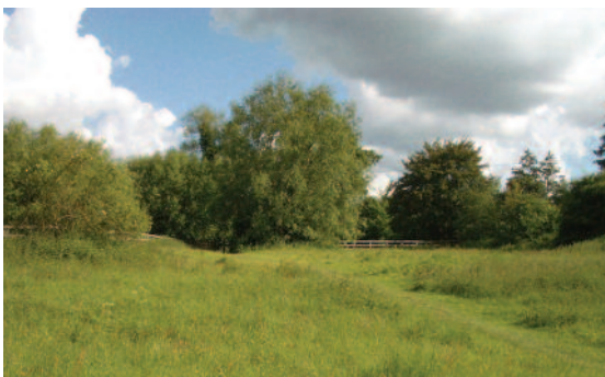
Neutral Grassland, Hertfordshire.