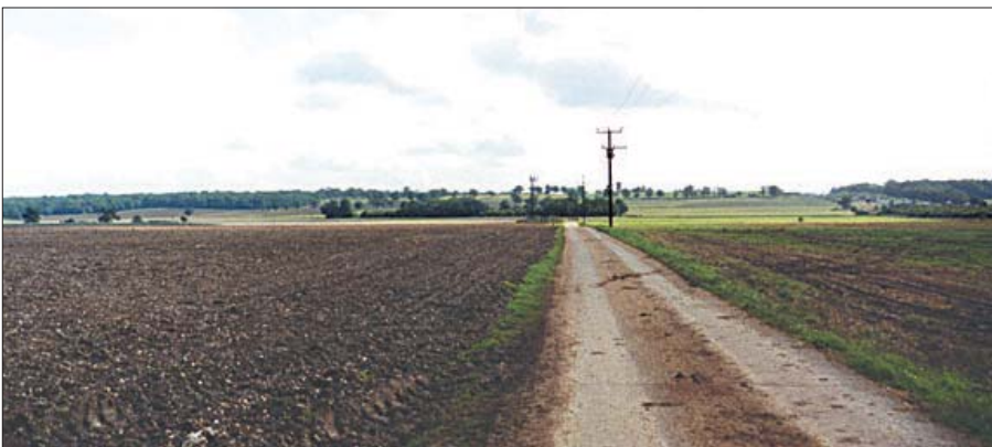
• Open arable fields towards Shenley Ridge