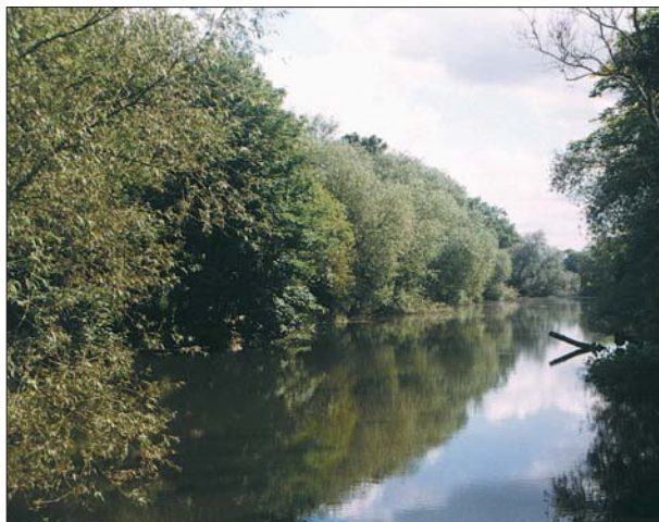
• Restored wetland, London Colney

A broad and shallow basin of the upper River Colne, with some extensive panoramas over arable fields, both along the Vale and up towards Shenley Ridge to the south. Mixed land uses include arable, extensive areas of active and restored mineral extraction and urban fringe development. Areas of wooded farmland estate characterise the north-eastern part of the area.