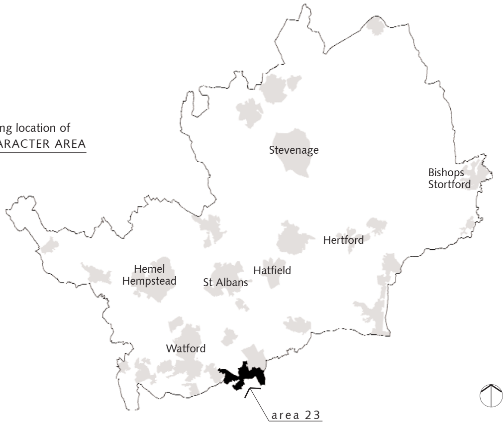
County map showing location of LANDSCAPE CHARACTER AREA