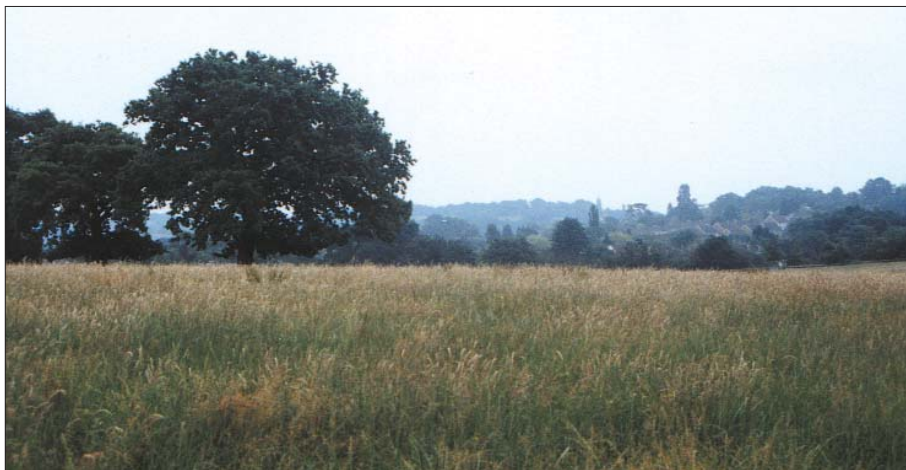
• Wooded skyline at Elstree