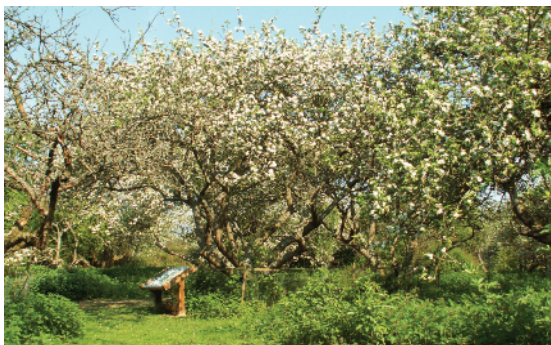
Terwin Orchard, Hertfordshire.