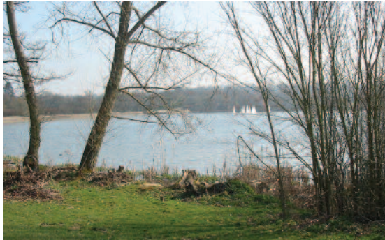
Wetland habitat, Aldenham Reservoir.