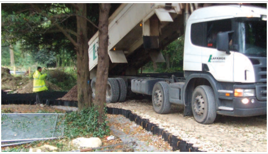
Installing a special surface to allow for heavy plant access through sensitive woodland during construction.