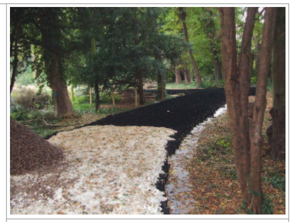
Use of a Cellular Confinement System to allow access for construction traffic through retained trees.