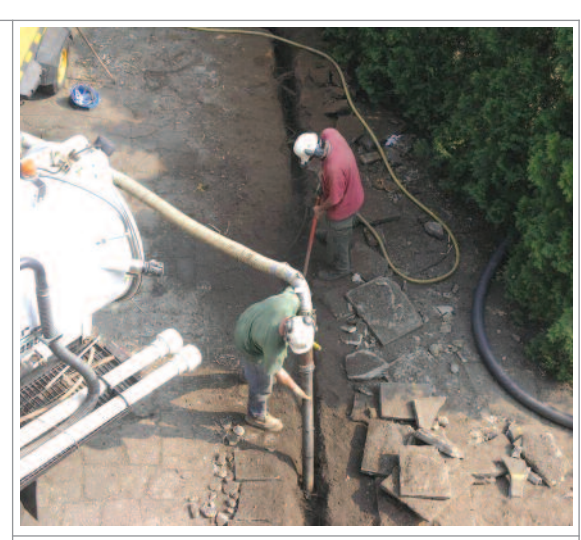
Excavating around tree roots using an air spade to avoid damage.

The photograph to the right shows a trench being excavated along the footprint of a proposed extension. All roots within the trench were plotted, allowing the foundation of pile and above ground beam foundation to be.