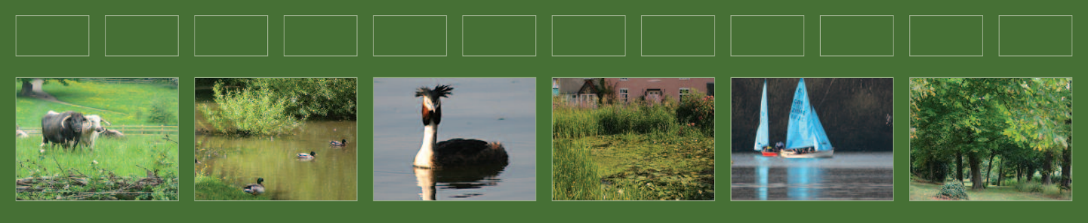
Part C - Trees and Development December 2010