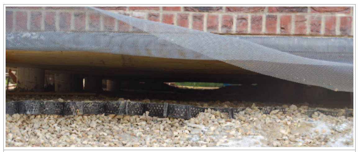
Use of house deck ® foundation system with anti heave void, to allow for foundations to be constructed within the tree root protection areas, and above ground level. This construction method prevents any future structural damage caused by ground heave due to the removal of trees on clay soil before or after construction. Although voids can become homes to vermin, a metal mesh net will prevent this.