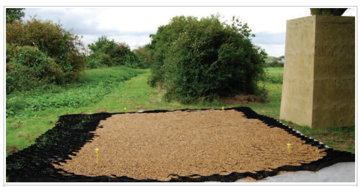
Ground protection used effectively to allow for construction within a tree root protection area, and the tree stem appropriately protected from any collision with construction vehicles.