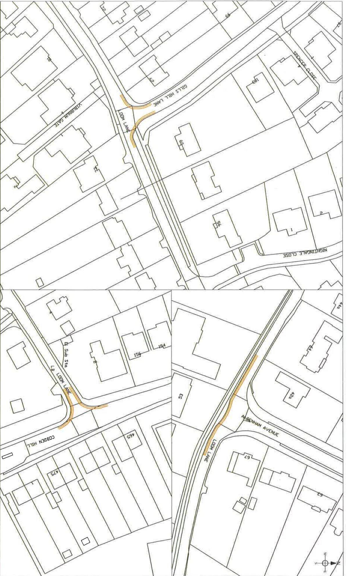
Title: TRO drawing for Waiting Restrictions in Roads without Parking Controls in Radlett

Key — Existing Restrictions — Proposed Double Yellow Lines