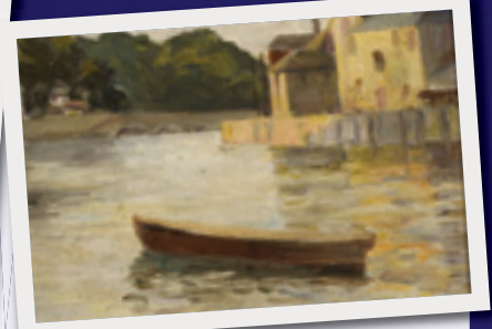
Above: Scenes from Cornwall

takes inspiration from the many film and television programmes he worked on at Elstree Studios during his long career as a scenic painter in the British film industry.