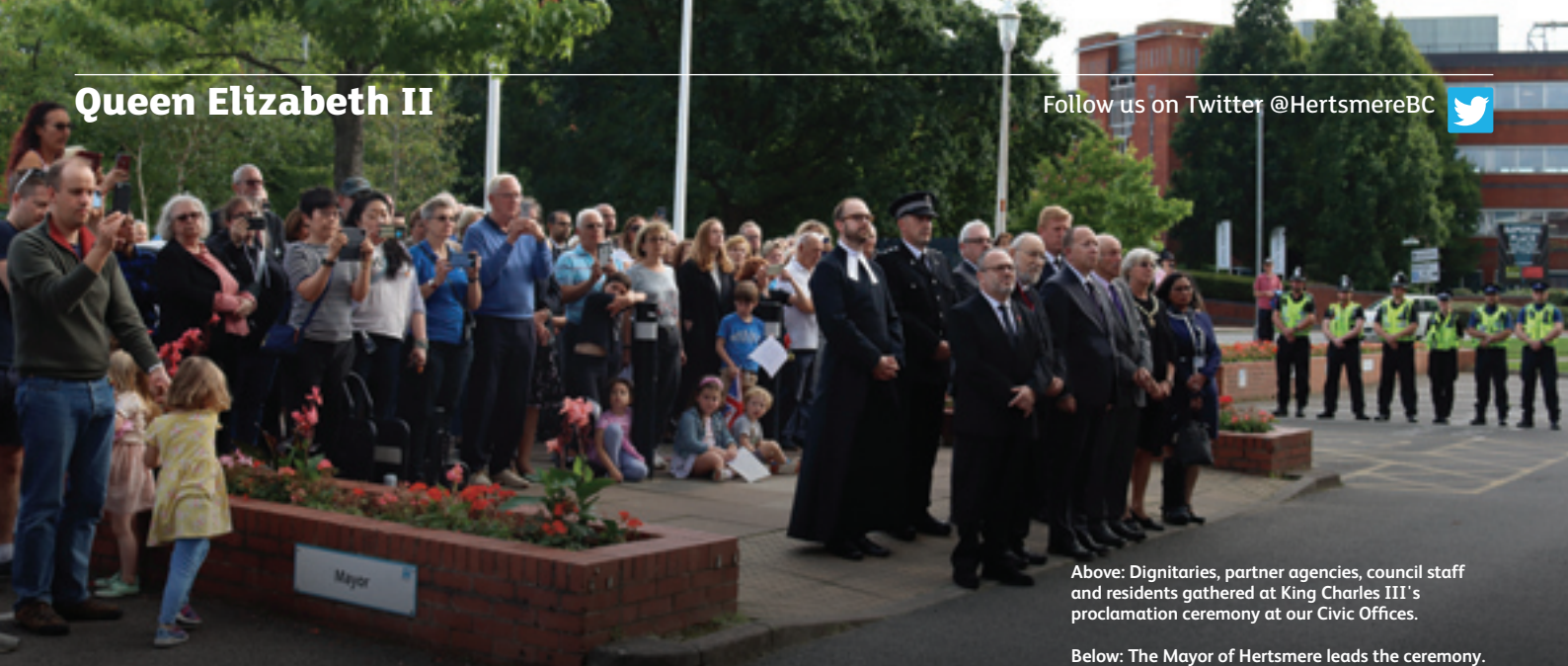
Above: Dignitaries, partner agencies, council staff and residents gathered at King Charles III's proclamation ceremony at our Civic Offices.