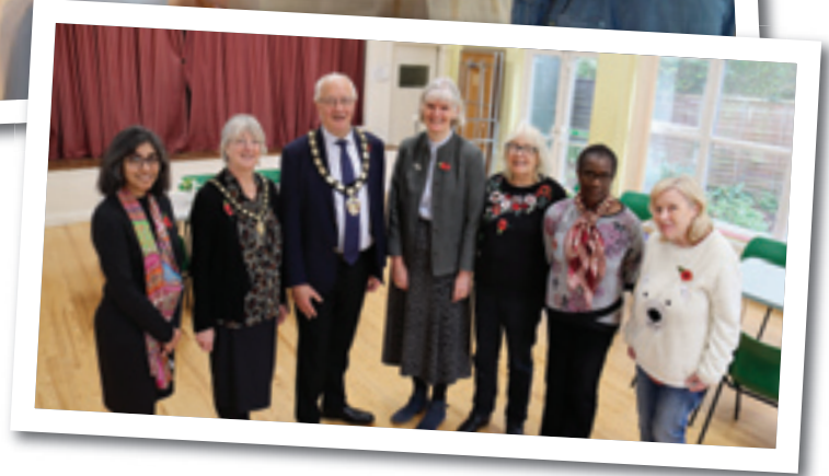
Above left: Summer meals at the BECC in Borehamwood