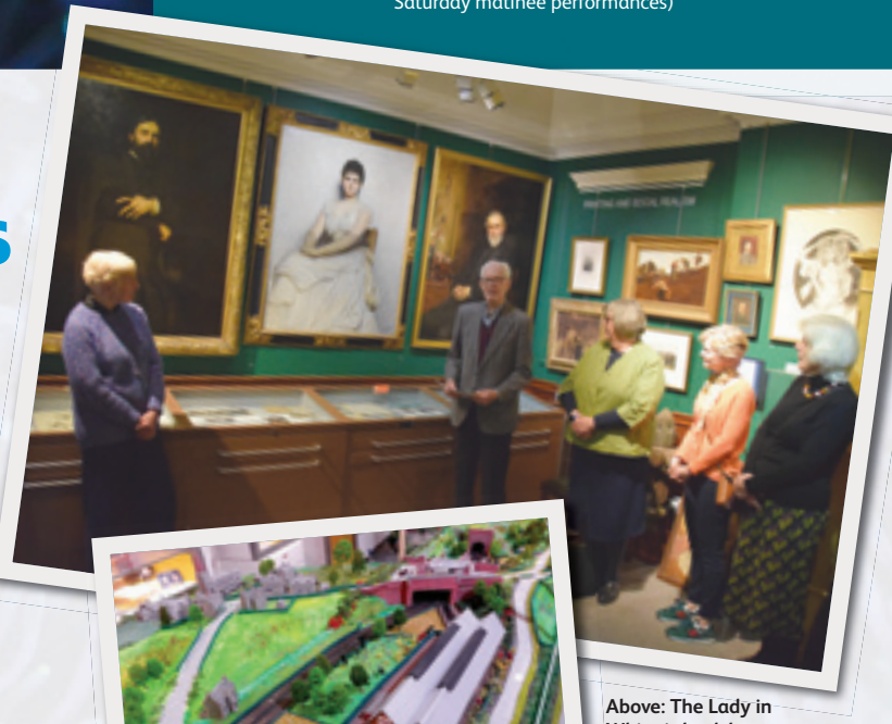
Above: The Lady in White is back home.

An 18-foot scale model shows how the town would have looked if Elstree had joined the London Underground. The exhibition recreates the Elstree extension with information boards telling the story through photographs, drawings and plans starting with the initial idea and long-term effects of the post-war cancellation.