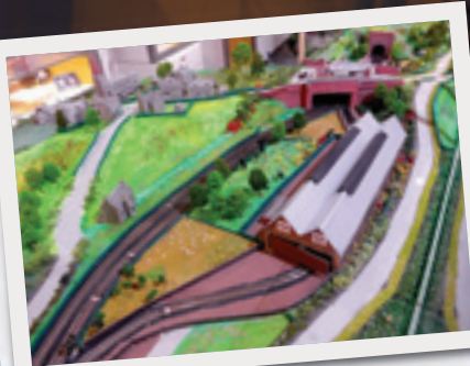
Left: Off The Rails scale model.

Open Tuesday, Wednesday and Thursday midday to 6pm and Saturdays 10am to 3pm.