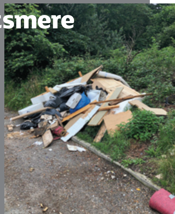
Fly tipping at Galley Lane, Barnet.

For more information on how to dispose of your waste responsibly or find a registered waste carrier, please visit www.hertsmere.gov.uk/flytipping .