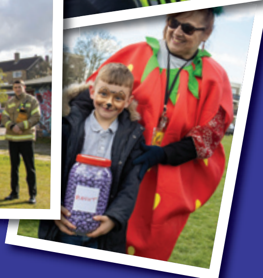
Above: A community event in Borehamwood and Over 60s event in Potters Bar.