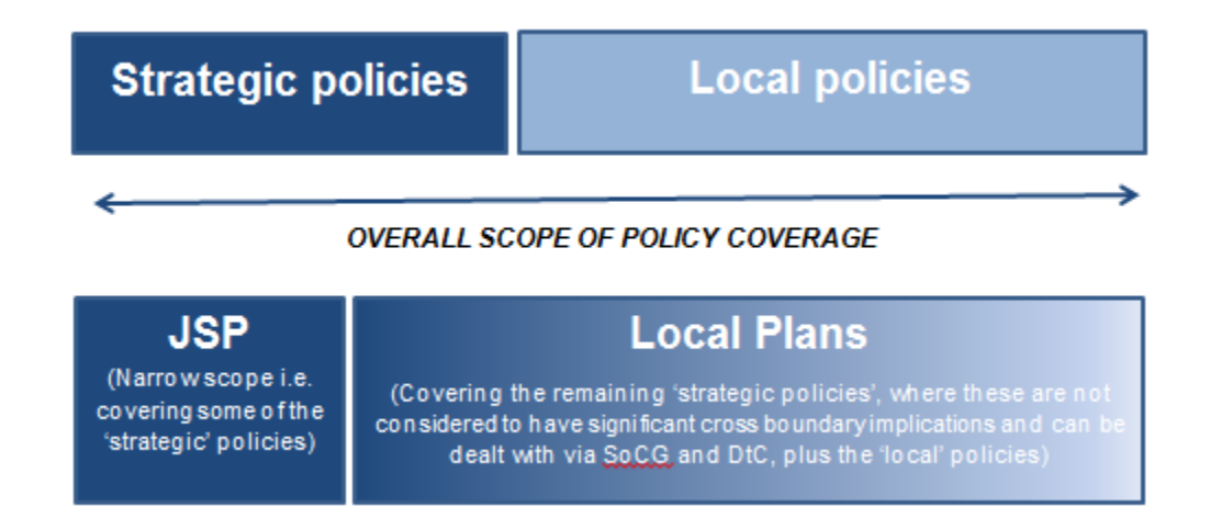
Figure 3: Relationship between the South West Herts JSP and Local Plans

4.37 Each council will continue to be responsible for preparing its own Local Plan, but the JSP will also provide the platform to consider how the challenges of growth in the wider South-West Hertfordshire area can be addressed longer term (i.e. to 2050). Figure 4 below illustrates how these two key planning documents will fit together.