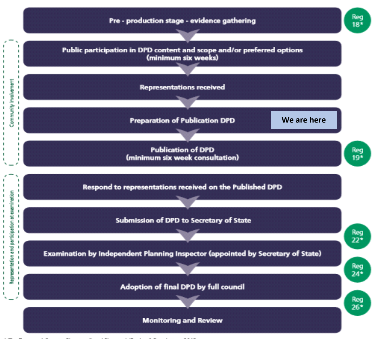
Figure 1: Key stages in preparing a Local Plan

* The Town and Country Planning (Local Planning) (England) Regulations 2012 Figure 2: Key stages in the preparation of Development Plan Documents (e.g. Local Plan; Area Action Plan)