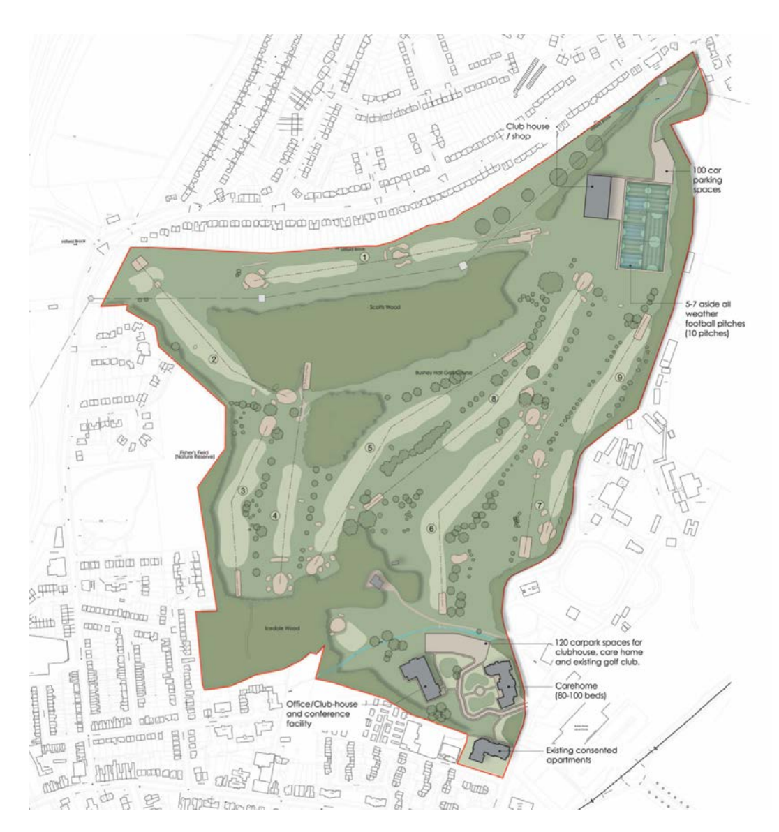
Figure 2: Phase 1 Proposed Site Plan