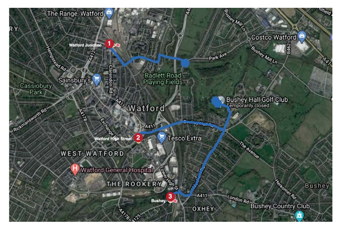
Figure 4: Walking routes from local railway stations

The BHGC site remains accessible to Watford Town centre and is just as accessible to local transport links as the existing stadium and in fact has a shorter walk distance to Watford Junction railway station than the existing stadium at Vicarage Road (0.8 miles and 15 minute walk compared with the existing stadium which is 1.2 miles and a 24 minute walk) as shown on Figure 4 below. Figure 4 also shows the walking routes from Watford High Street (0.9 miles and 19 minutes) and Bushey (0.8 miles and 18 minutes) railway stations. A range of sustainable transport initiatives, including electric shuttle buses and bike hire schemes will be explored in the detailed design of the scheme to reduce reliance on the private car.