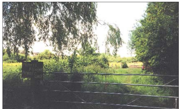
Leggatts Park • view west from Well Road (E. Staveley)