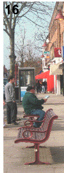
16 & 17. Note how the benches and the other pieces of street furniture have been placed in a neat, orderly row. Picture 18. Could the bench be turned 180 degrees to face the shops.