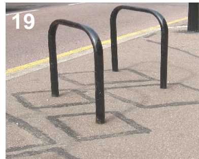
19. Good cycle rack colour and placement (Bushey High Street)

The County Council also have guidance on cycle parking provision that can be used for designing and implementing new cycle stands,