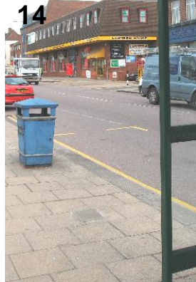
14. Less appropriate siting of a bin (High Street, Potters Bar).