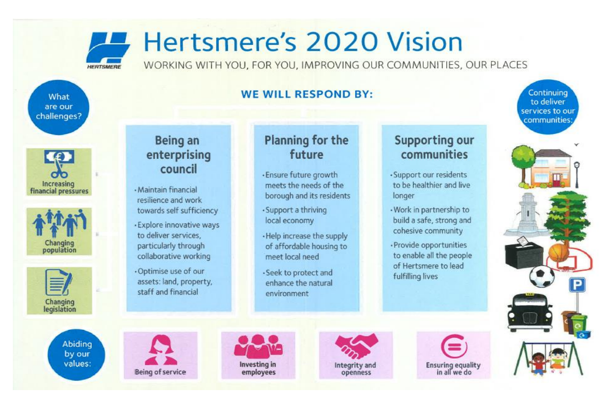
Figure 2 – Hertsmere's 2020 Vision

The council's annual corporate action plan for 2018-19 set out the key high level actions that the council undertook during the year. It highlights those projects which are over and above our day to day service delivery and will have an impact on our residents in either how services are delivered or how we generate income.