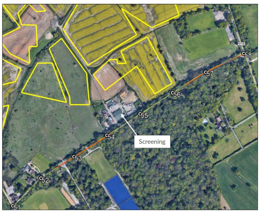
Figure 58 - Potentially affected locations on Butterfly Lane

Figure 58 below shows the location of these four locations on Butterfly Lane, and the subsequent Figure 60 shows the location of the proposed screening: